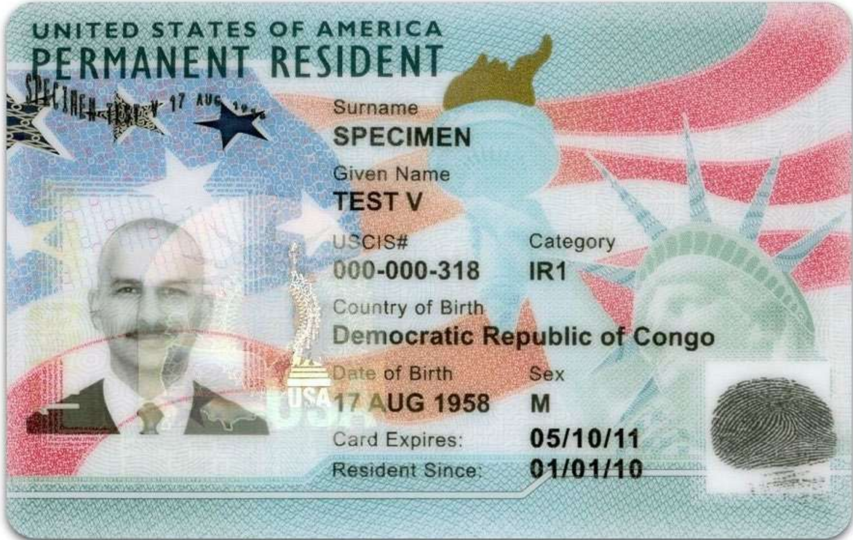
The average wait for a green card in 2018 was five years and eight months.

The proposed bill seeks to reduce wait times for green card availability and “allow immigrants with approved family-sponsorship petitions to join family in the United States on a temporary basis while they wait for green cards to become available.”