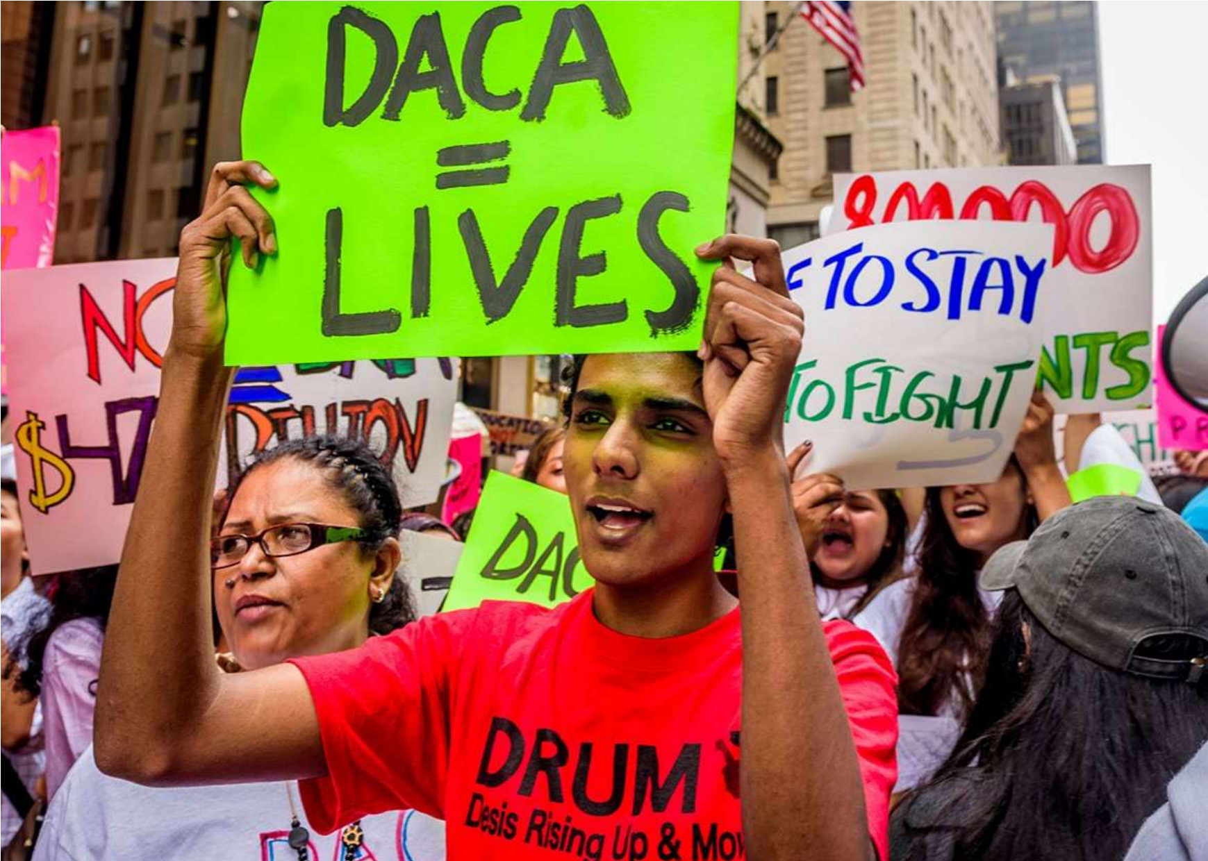
They entered the United States illegally.

Regarding illegal immigrants, some want to make sure that DACA (Deferred Action for Childhood Arrivals) individuals can stay in the country and eventually become U.S. citizens.