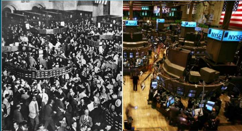
These photographs show how many less people are now on the floor of the New York Stock Exchange. The photograph on the left is from 1932. The photograph on the right is from 2007. These images are from the New York Times.