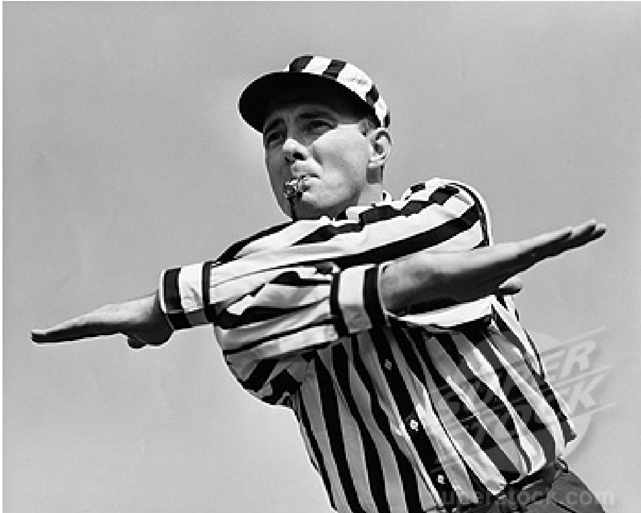
This is a picture of a football referee, circa the 1950s, signaling an incomplete forward pass.

12. If nobody answers, points are not taken away.