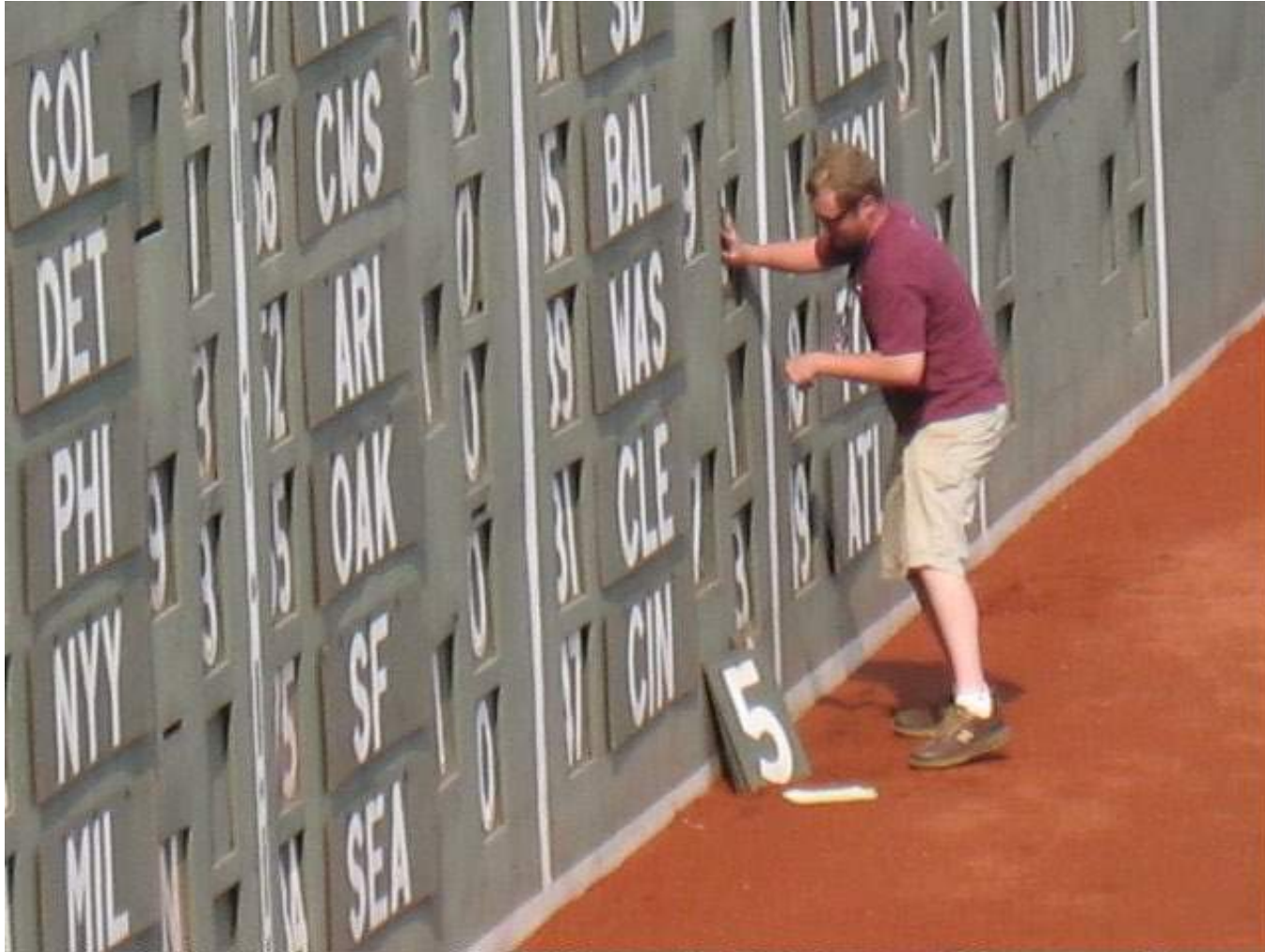
An employee at Boston's Fenway Park changing the scoreboard during a baseball game on the "Green Monster" in left field.

13. Today's score will be added on to next week's score, and next week's score and so on until the middle of the marking period.