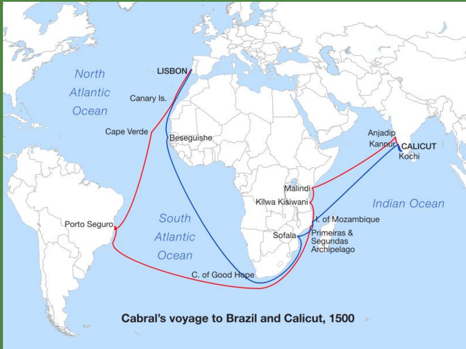
Cabral's voyage to Brazil and Calicut, 1500

This map shows the voyages of Pedro Cabral in 1500, including when he was blown off course and landed in what is now Brazil.