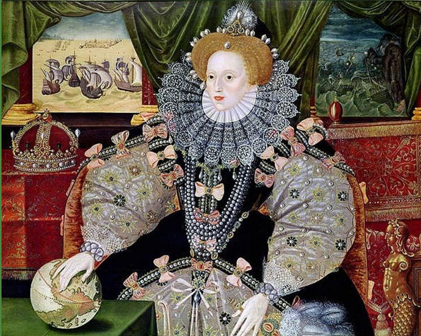
Queen Elizabeth I of England is shown in this circa 1588 portrait to commemorate the defeat of the Spanish Armada.

A time of the great revival of art, literature, and learning in Europe which marked the end of the “medieval” world and the beginning of the “modern” world.