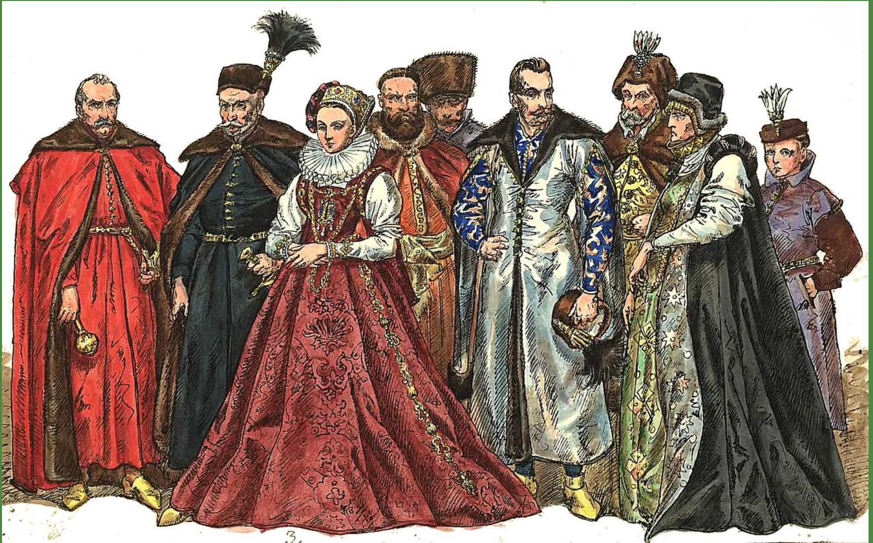
This image shows Polish individuals of great influence or importance from 1576-1586. This image was created by Jan Matejko (1838-1893) at an unknown date.

A social class that possesses more privileges or prominence than most other classes in a society. One's status is passed from parent to child.