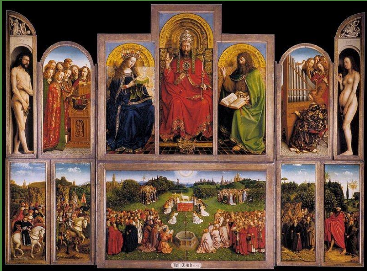
This image is titled The Adoration of the Lamb. It was painted in 1432 by Jan van Eyck (1395-1441). It is located in the Cathedral of Saint Bavo in Ghent, Belgium.