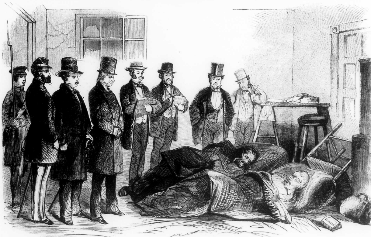
GOVERNOR WISE, OF VIRGINIA, EXAMINING THE WOUNDED PRISONERS IN THE PRESENCE OF SENATOR MASON, THE REPORTER OF THE N. Y. HERALD, OUR SPECIAL ARTIST AND AN OFFICER OF MARINES.

Till more is known about the papers found in Brown's house, it would be premature to give any definite opinion. It appears certain there were letters found from Gerritt Smith, one of which had contained money. That Brown could not of his own means have paid